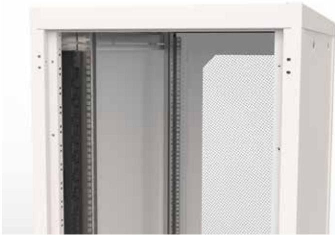
A-type extrusions with 0U PDU

The Air Separation Frame is joined to the extrusions and slides together with the extrusions. The top and bottom parts are equipped with brushes which provide basic cable management between the front and rear part of the rack.