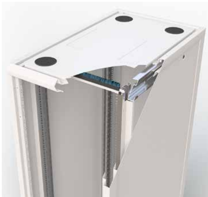
RSF-42-60/10A - with A-type extrusions

In addition to the NG solution, we also developed a new solution for the Air Separation Frame. This improved solution gives the customer ultimate flexibility. The customer can simply change the position of the extrusions without influencing the position of the Air Separation Frame.