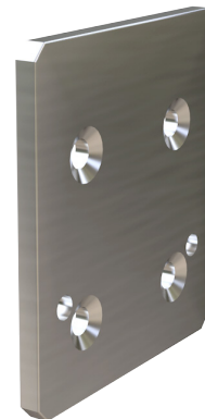
Mounting plate for PDU type IP-Dxx