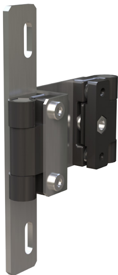
Swivel bracket – main body

Swivel brackets are equipped with adjustable torque and position control hinges that allow setting and adjusting exact position of the PDU inside rack allowing swinging at half-round range.