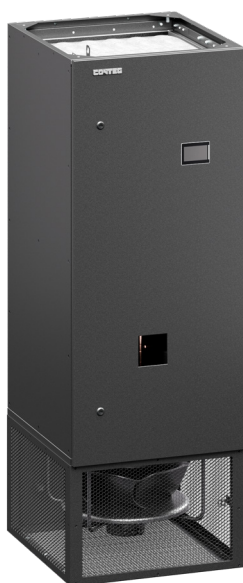
CoolRAC CW S

➤ CoolRAC CW water cooled room cooling units are designed to be connected to any system with a cold water source.