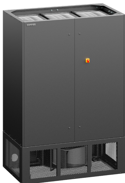
CoolRAC CW M