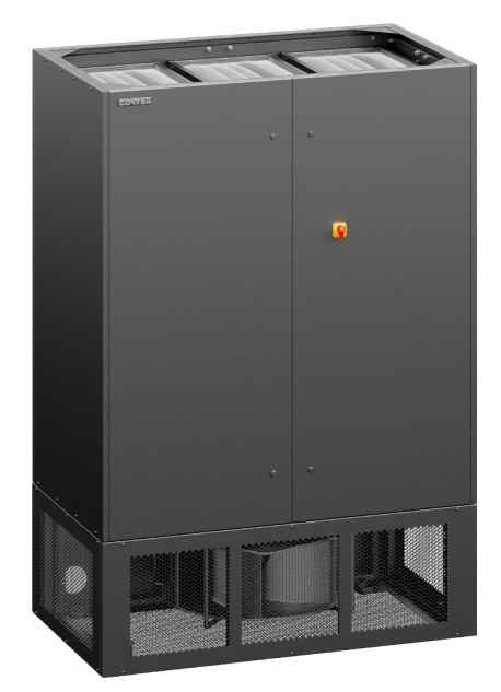
CoolRAC XC M